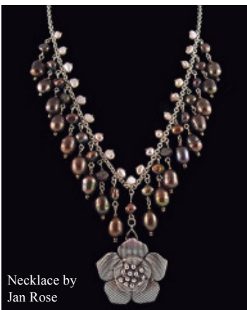
Necklace by Jan Rose

If you are interested in participating in Studio Fair in any capacity please contact Crystie at arts@studio2880.com or 250-562-4526.