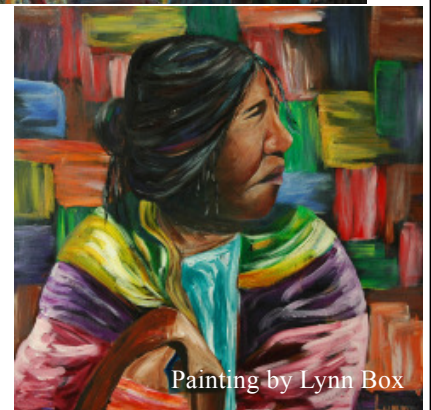
Painting by Lynn Box