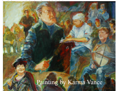
Painting by Karma Vance

The Feature Gallery is not wanting for excitement in the coming months so be sure to stop in often to check out the variety of work that will be showcased.